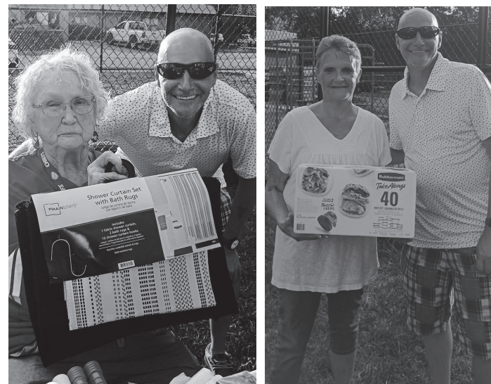
Members enjoyed raffles, games, prizes, music and food during the Back-to-School Bash in August.