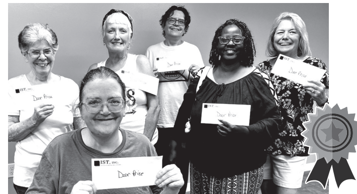
Winners received $100 cash prizes in a drawing at the annual meeting. Winners' names were drawn from those attending the meeting from the seven cul-de-sacs.

The annual meeting ended at 7:33 p.m. The board met in closed session and the meeting adjourned at 8:30 p.m.