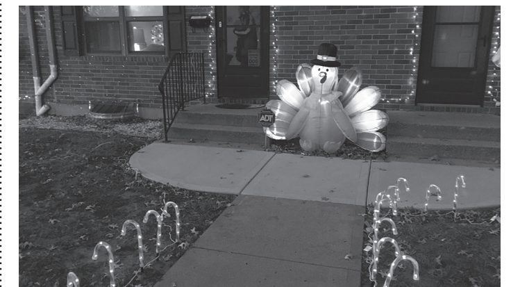
Cheerful seasonal decorations lit up Independence Square yards during the holidays.

Failure to comply with the visitor policy will place the member in default.