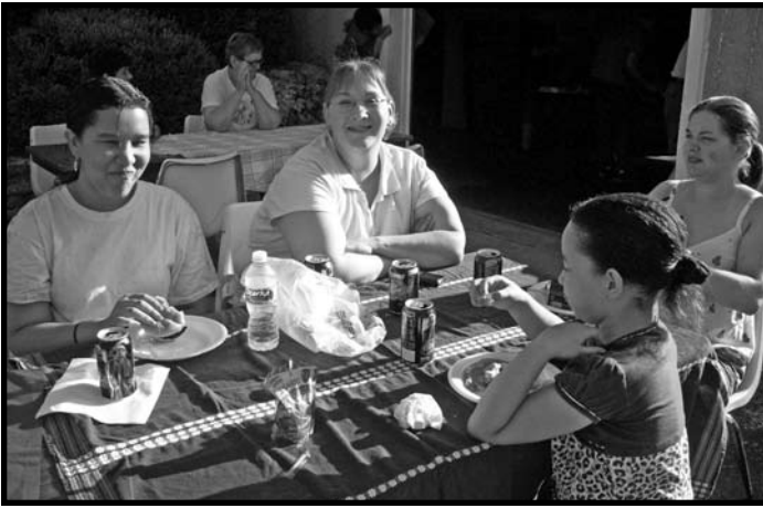
The Independence Square Memorial Day cook-out was a big success. Members enjoyed hot dogs, hamburgers and potluck dishes.