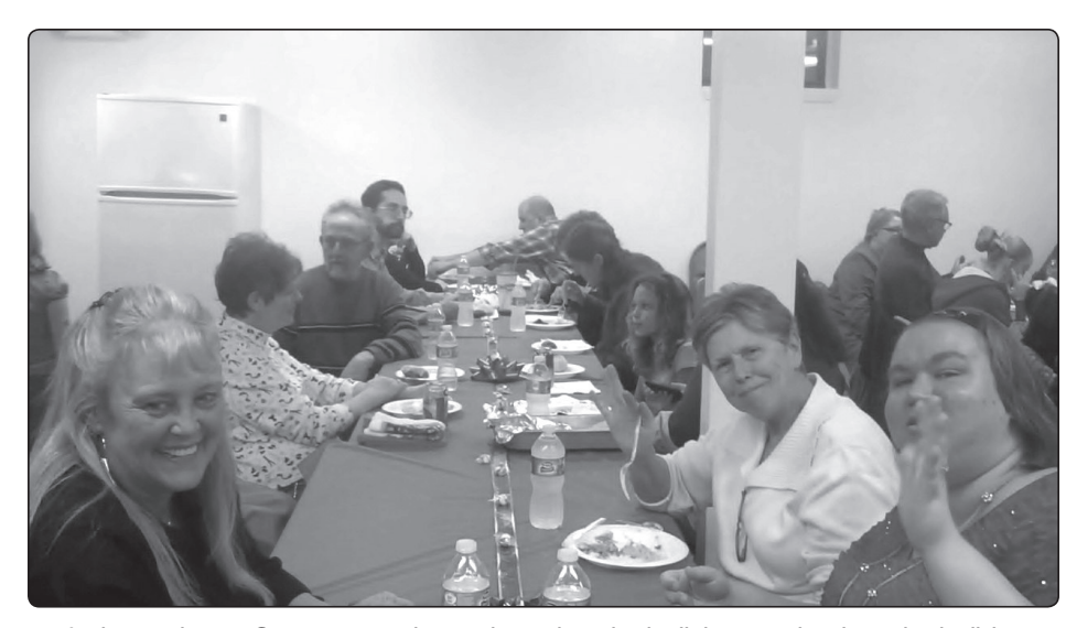
Independence Square members shared potluck dishes and enjoyed a holiday dinner on December 15 in the clubhouse.

Then, watch the car from a window or door while it is warming up.