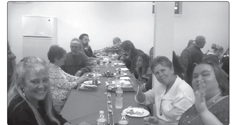
Independence Square members shared potluck dishes and enjoyed a holiday dinner on December 15 in the clubhouse.

Then, watch the car from a window or door while it is warming up.